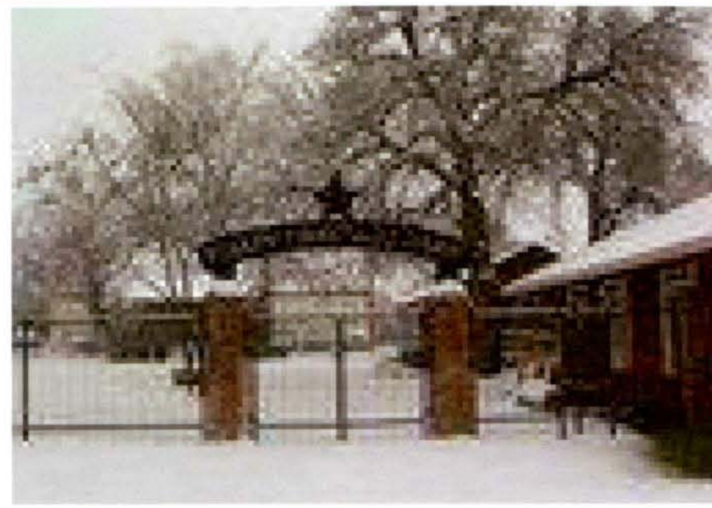
Knapp Heritage Park 201 W. Front Street